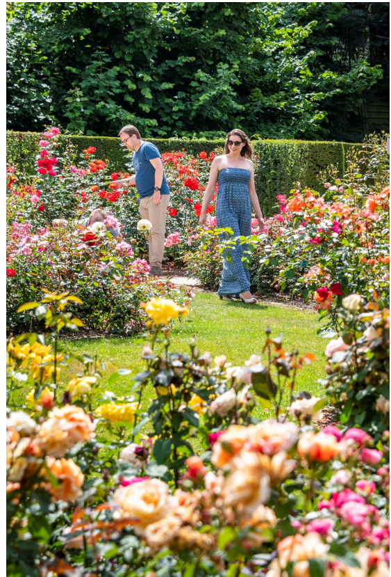
Rose Garden Coloma

The current French garden has been nestled neatly between the orangery and the location of the former castle.